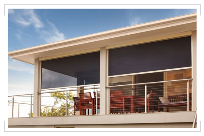
Living The Dream

Specially designed for alfresco entertaining areas such as pergolas, verandahs and balconies, the Ambient Blinds range attractively integrates into your design style. Equally suitable for domestic or commercial applications with design options to suit individual requirements and a wide range of environmental conditions.