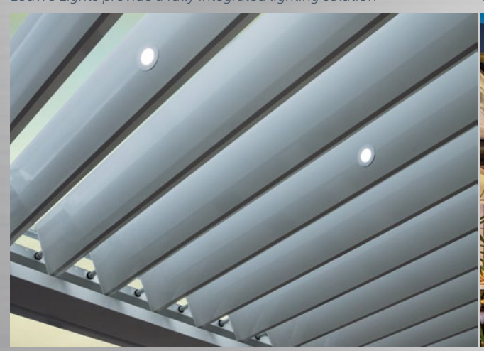
Precisely control the level of sunlight you desire