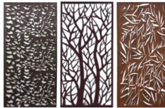
REAL RUST SCREENS 1800 H x 900mm W panel. Available in Flora, Forest or Jungle. SC-10476/7/8