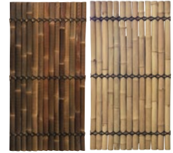
HALF RAFT PANEL 40 x 1800 H x 900mm W. Single sided screen. Made from natural bamboo. Available in Black or Natural. LG-17327/30