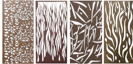
RUSTED LOOK SCREENS 1800 H x 900mm W panel. Lightweight, quality made. LG-17333/4-516/7 Also available in 1200 H x 600mm W