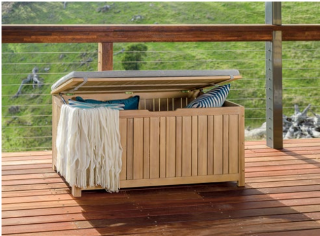
Accessories shown not included.