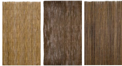
ROLL SCREEN This is a natural product, easy to install and great for covering unsightly fences. SC-10036-8 (Left to right) Reed, Brushwood and Willow.