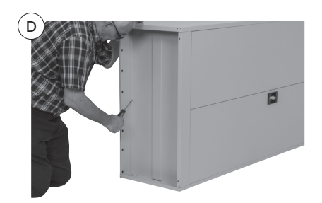
Turn the cabinet on its side and fasten the floor panel with 1 screw and then use a screwdriver to push the "push-through" slots.