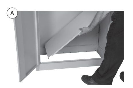
Place the Floor Panel into position with the cutouts facing the front.