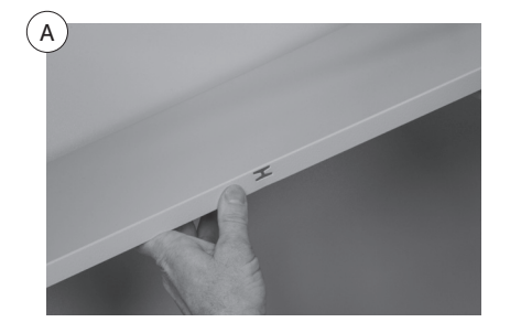
cate the Top Panel - the front has the 'push-through' slots Lift the Top Panel into place from the inside