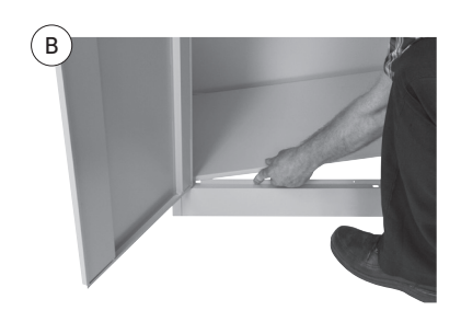
Ensure the front lip goes over the top of the Front Panel.