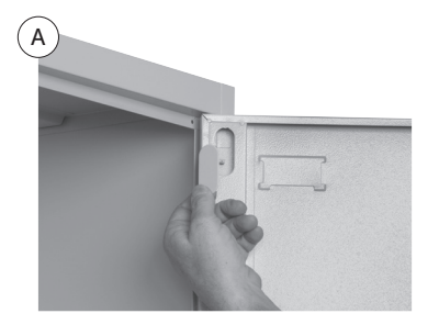
The doors have a spring loaded hinge to allow removal at any time. A cover is supplied for these access points. Simply push into place.