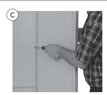
Secure with screws to hold side and rear together