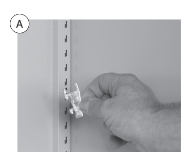
Turn the cabinet upright and place the Shelf Supports into the side rails of the cabinet - 4 per shelf at the same height.