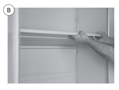
Place the Shelves onto the supports and ensure that they are locked into place.